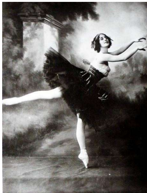
Figure 8 - A. Pavlova in the choreographic performance "Butterfly", music by R. Drigo. 1910. Photo. Book Museum. State Russian Library.

The ballerina loved to convey the life of nature in her dance: the flutter of butterflies, leaves whirling, wind blowing, flower getting to blossom, etc., because she felt herself an integral, organic part of the whole. Her sculptures "A. Pavlova – a dragonfly", "A. Pavlova – a butterfly", "A. Pavlova – arabesque" are not just representations of one and the same ballet poses, but its interpretation through different images, dance motifs.