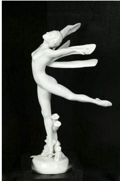
Figure 4 - “Dragonfly”. 1920. Glazed porcelain. The Victoria and Albert Museum. London. A sculptural image created by A. Pavlova, then embodied from a plaster model on the oldest Folkstedt porcelain manufactory by Werner Weiherer, Germany.