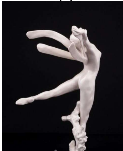
Figure 6 - “Dragonfly”. 1920. Glazed porcelain. The Victoria and Albert Museum. London. A sculptural image created by A. Pavlova, then embodied from a plaster model on the oldest Folkstedt porcelain manufactory by Werner Weiherer, Germany.